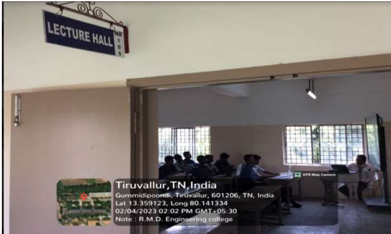
LECTURE HALL- MB 105