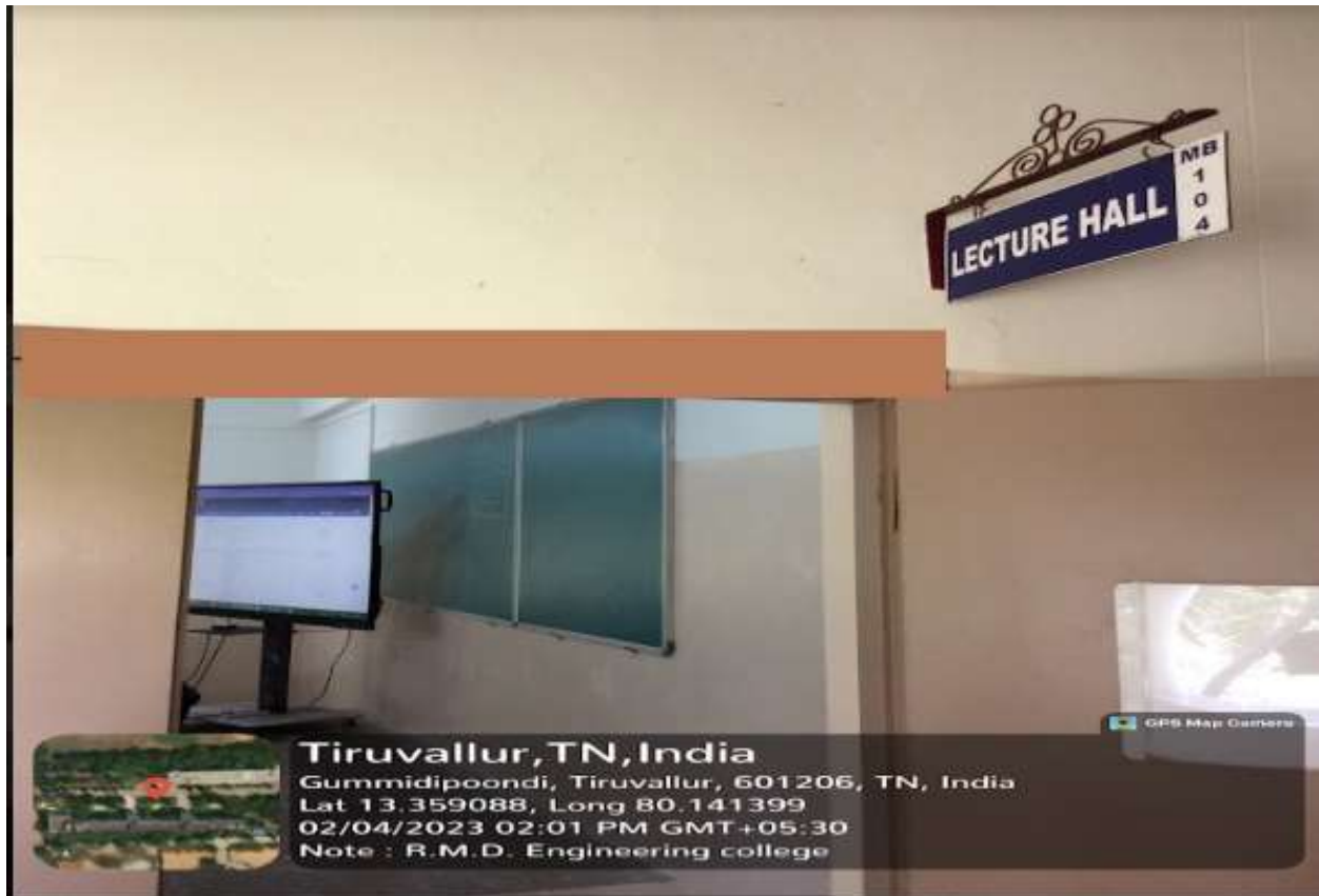
LECTURE HALL- MB 104