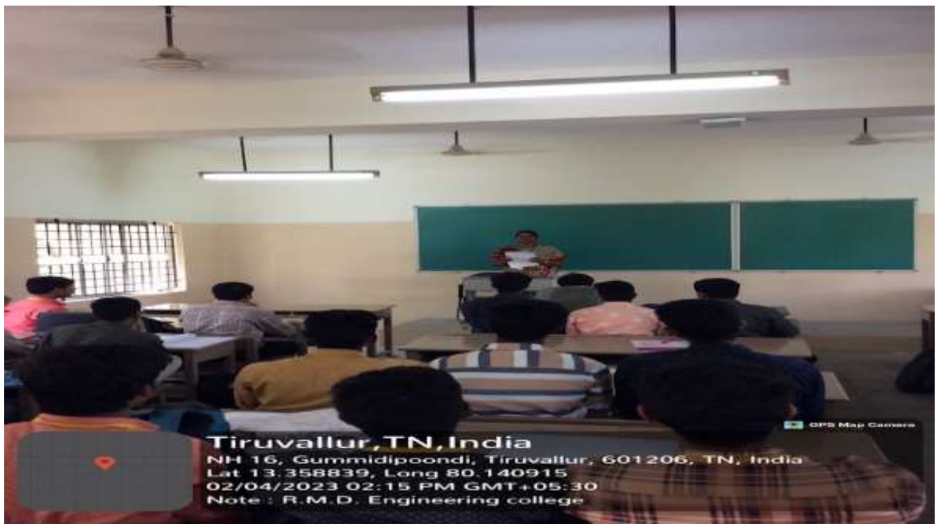
LECTURE HALL- MB 203