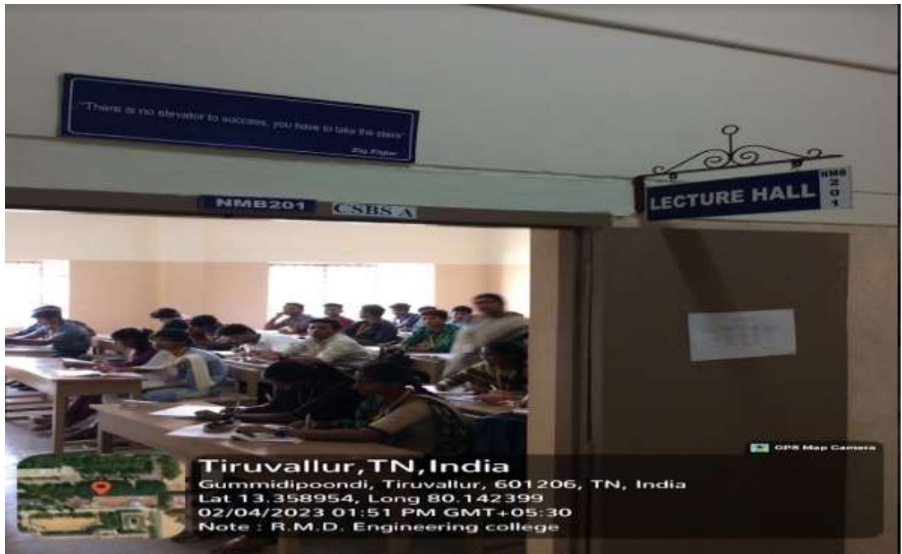
LECTURE HALL- NMB 201