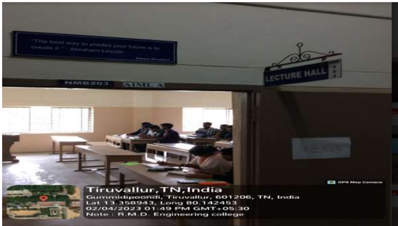
LECTURE HALL- NMB 203