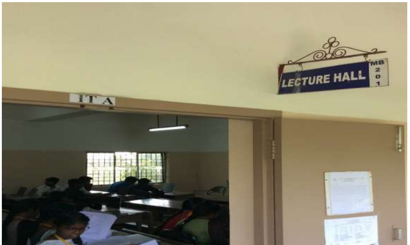
LECTURE HALL- MB 201