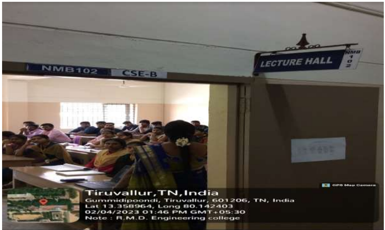
LECTURE HALL- NMB 102