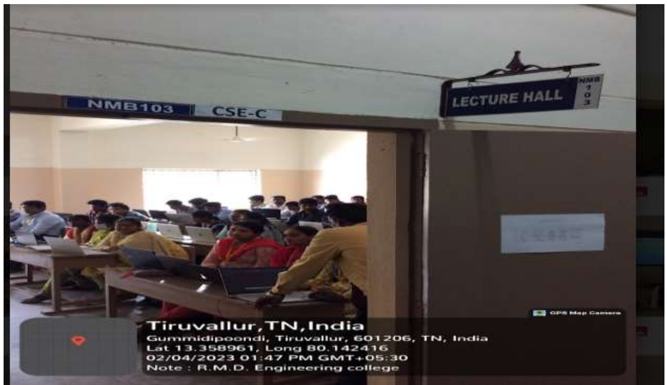
LECTURE HALL- NMB 103