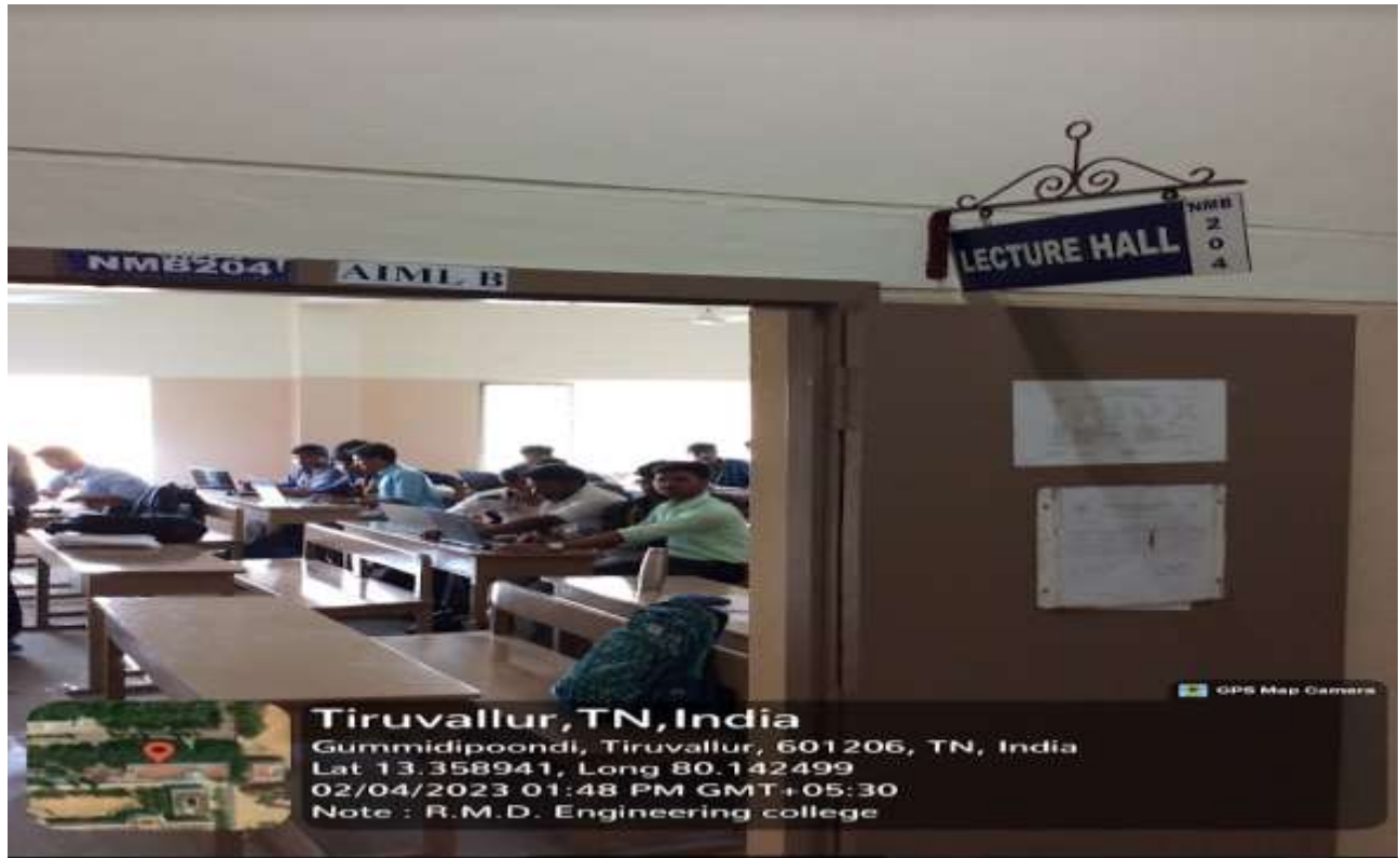
LECTURE HALL- NMB 204