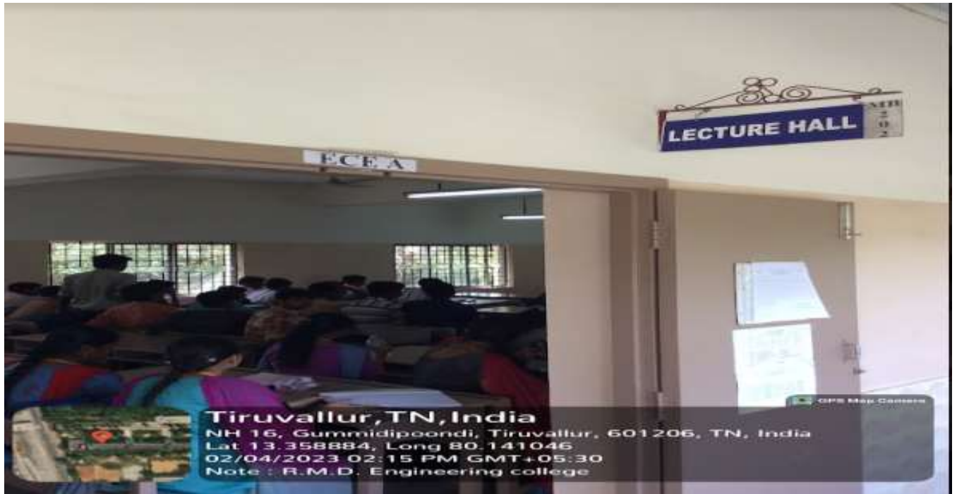
LECTURE HALL- MB 202